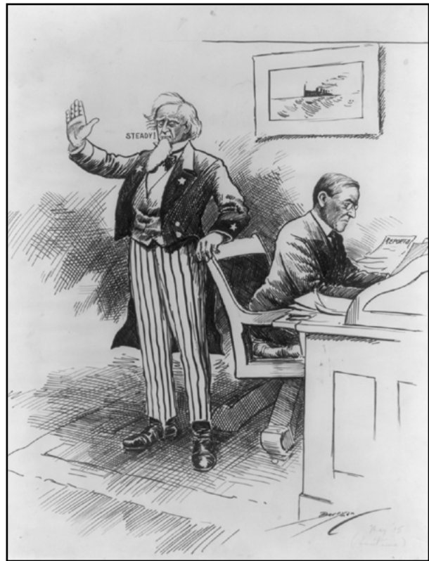
Public outrage after a German U-boat sank the RMS Lusitania on May 7, 1915, was significant but supporters of continued US neutrality counseled against US involvement in Europe's war, as in this editorial cartoon showing Uncle Sam urging President Wilson to be steady in his response.